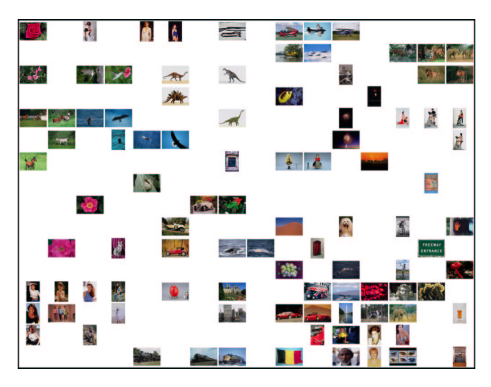
Fig. 1. The 16 \times 16 -sized TS-SOM level trained with the user interaction feature.

User-provided relevance evaluations are notably similar to hidden annotations [12]. In some occasions, the image database may contain elaborate manuallyconstructed captions or other annotations. Such annotated databases can be found eg. in commercial image libraries and medical databases. Implicit annotations can also be found, eg. from the text surrounding an image in the WWW. These annotations describe high-level semantic content of the image and often contain invaluable information for retrieval. Hidden annotations can be seen as high-quality user assessments. Images having a certain term in their annotations can be seen as the set of relevant images when the user was querying for images containing the concept corresponding to the term in question. Our technique can thus readily be utilized for keyword annotations.